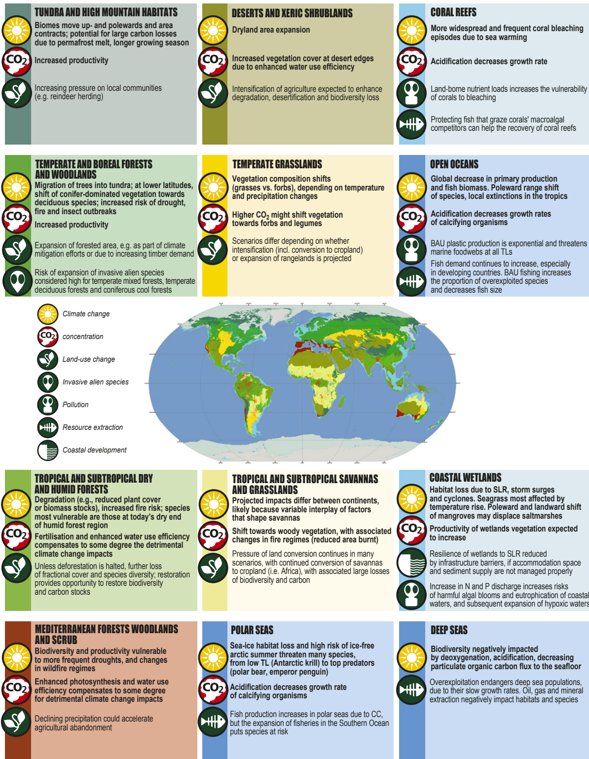
Fig. 1. Examples of future projected impacts of climate change (CC) and CO 2 on biodiversity and ecosystem processes, which can interact with other major drivers of change (such as land use change, resource extraction, and pollution, among others). Examples are given for terrestrial and marine biomes. Impacts of CC and atmospheric CO 2 concentration are in bold. BAU, business as usual and/or high-emission scenarios; SLR, sea-level rise; TL, trophic level. Modified with permission from ref. 9.

pressure from biological invasions that follow from direct human introductions (37).