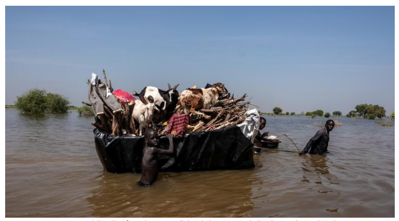
Families forced to move all their belongings, including livestock, South Sudan.

"This assessment shows that limiting warming to around 2C (3.6F) still requires global greenhouse gas emissions to peak before 2025 at the latest, and be reduced by a quarter by 2030."