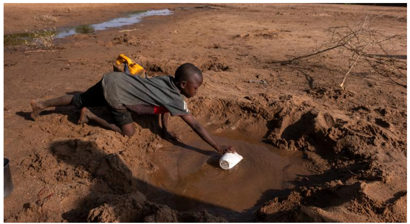
A young boy collects what little water he can from a dried up river due to severe drought in Somalia.